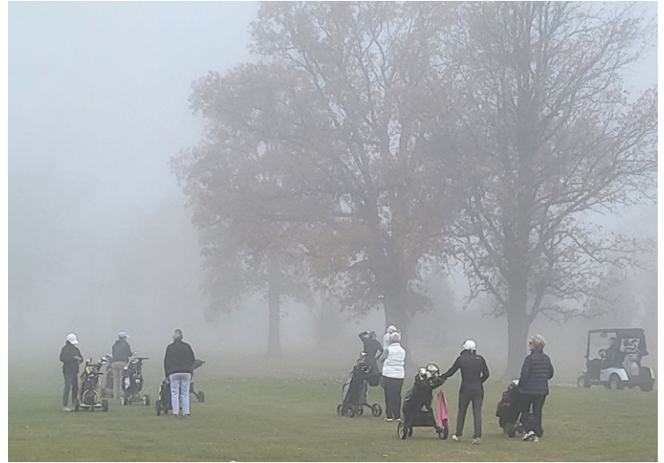
At least it wasn't a frost delay on October 25th as the ladies tee up.