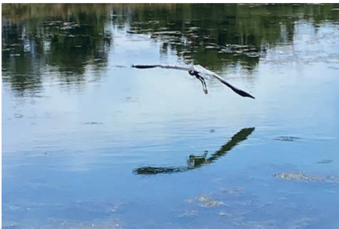
Cleared to land on #9 pond. July 9th