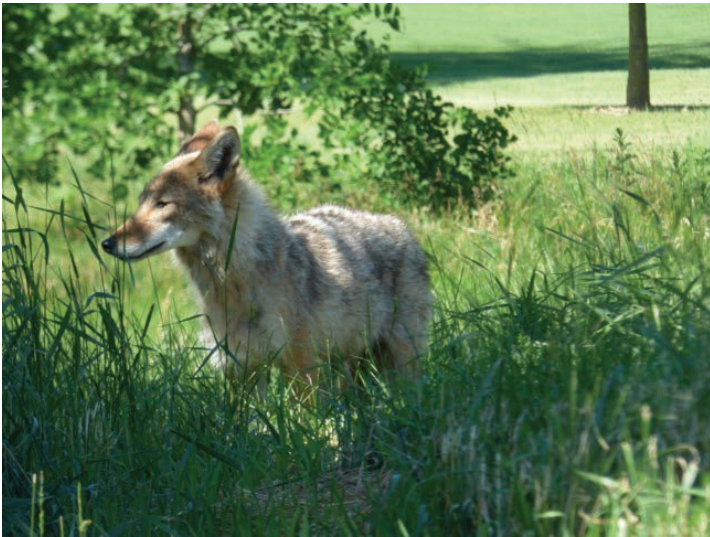
Coyote photo taken June 10th by Ken Musgrave

More wildlife shots from around the course. We really are lucky to see so much of our natural species. Thanks to those who have sent photos in to Deer Tracks!