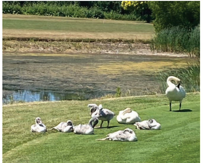
Nap time on #2 - July 9th