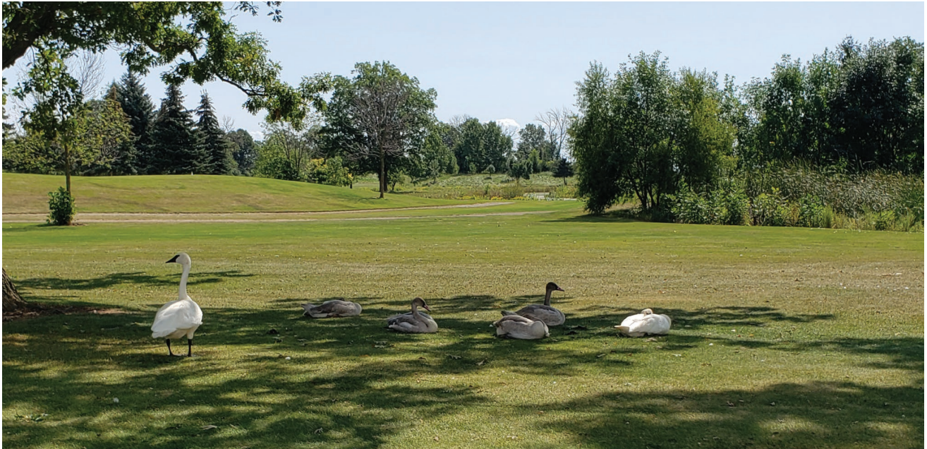
Catching some shade on #11 watching the Memorial Classic