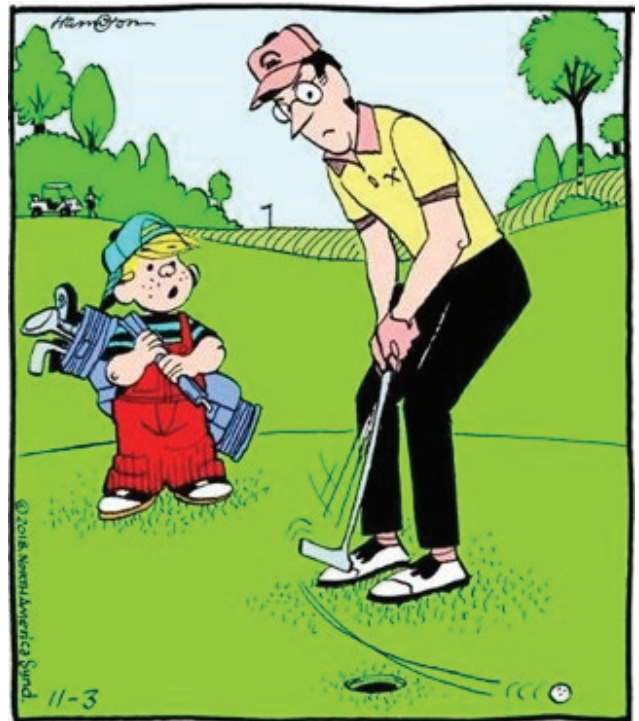
"AFTER SPENDING ALL THAT TIME PLANNING... HOW DO YOU STILL MISS IT?"