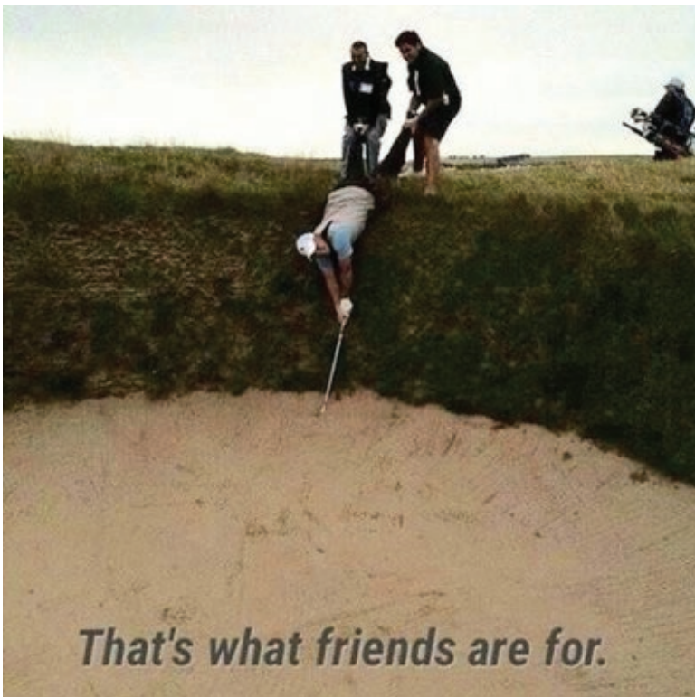
That's what friends are for.