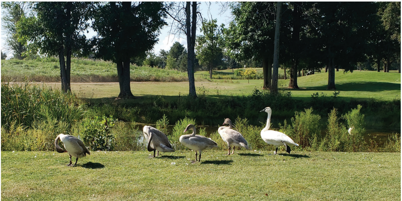
Preening on #11 pond. Dad is in the pond.