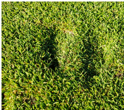
Deer Tracks! The photo on the right was captured by Anna Tang off the 14th tee. It had gone by the 13th green. The photo on the left was one of many 'deer tracks' across the 10th green. Yes, deer tracks! Very cool.