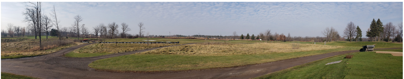
New 14th green - hole 4 is to the left in the distance