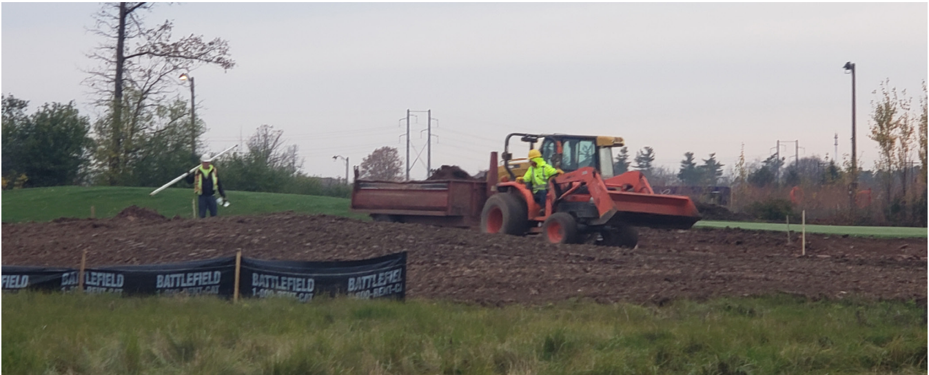
The golf architect and grounds workers specialize in golf course construction.