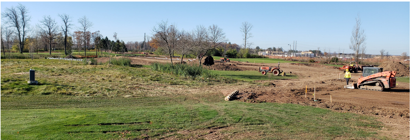
Early stages of realignment of 14th green