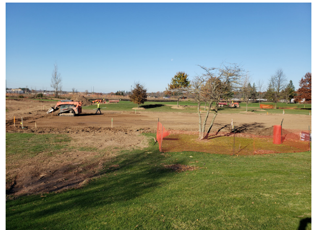
More work on #15