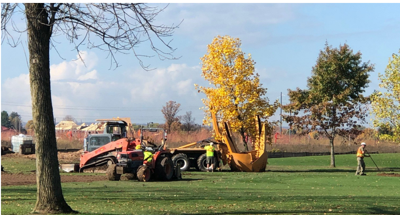
Moving trees on 14.

Hole four has been shortened with the green moved toward the pond with a realignment of tees. It will be tricky! Hole 14 has had the most significant change with the green moving to the left between the old green and 15 tee blocks. Hole 15 had the white and blue tee blocks moved up to the red tees. The sand bunker on the hill has been removed. All in all it looks very professionally done with the addition of many new trees and removal of a few others. The good news is most of the work has been completed so it should get a best chance to 'grow in' this Spring.