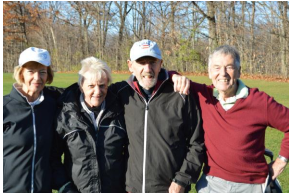
“The coffee sure tasted good today.”